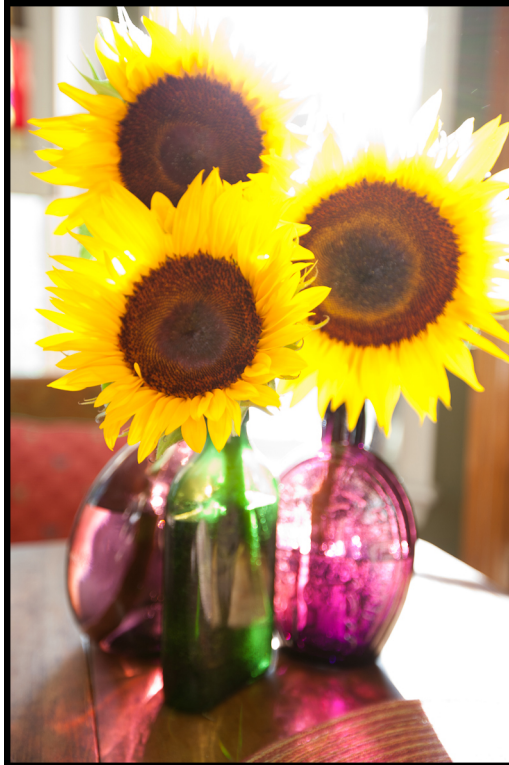
THREE-IN-ONE, p. 12

Thank you, Son, Thank you, Father, Thank you, Spirit . . . You're the Water of Life for my soul.